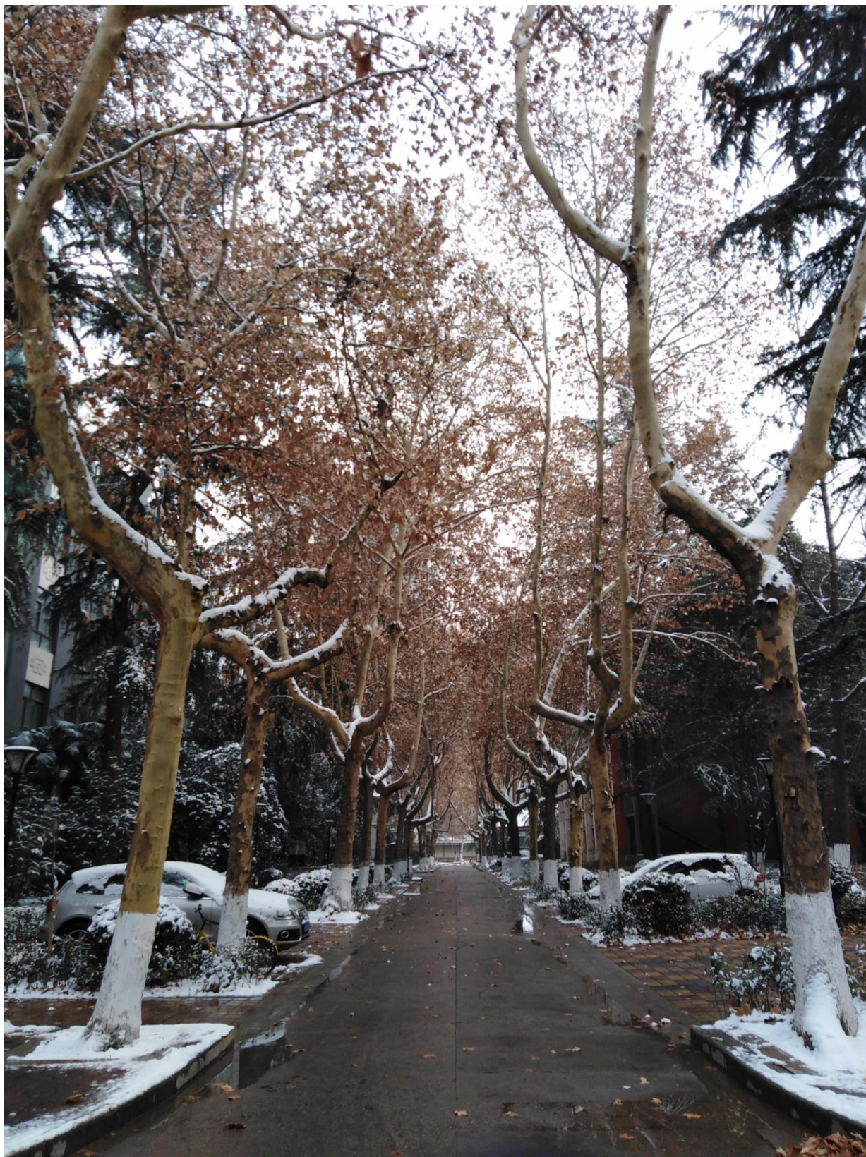
North Campus in January