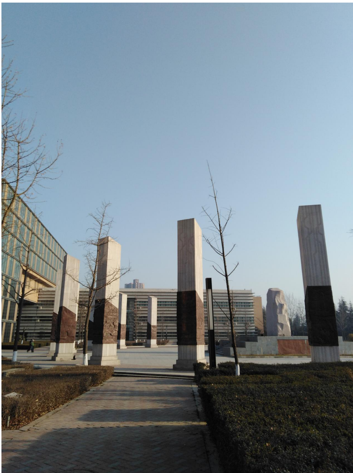
Early morning sun strikes the pillars at the main entrance to Xidian South Campus